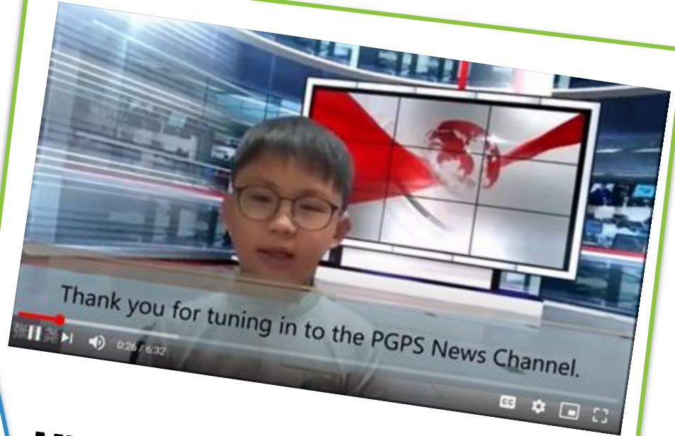
MTL Enrichment Programme