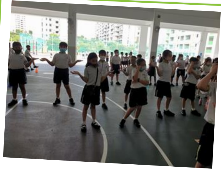
Math Around Us