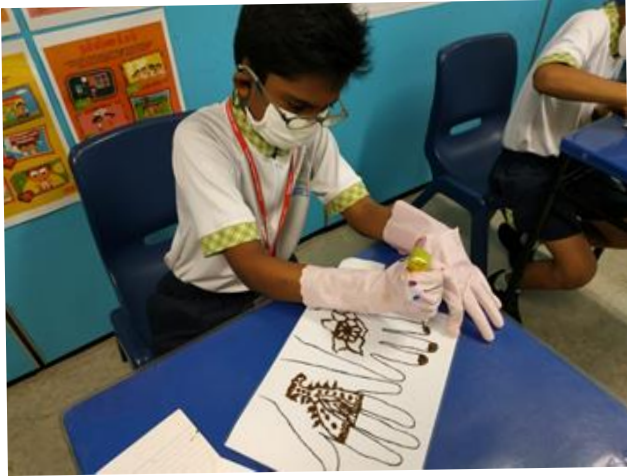
Learn it, Use it, Enjoy it! MTL Fortnight