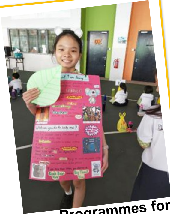
Science Programmes for Creating awareness