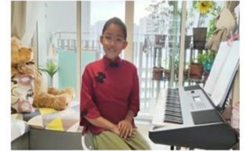
PGPS Got Talent!