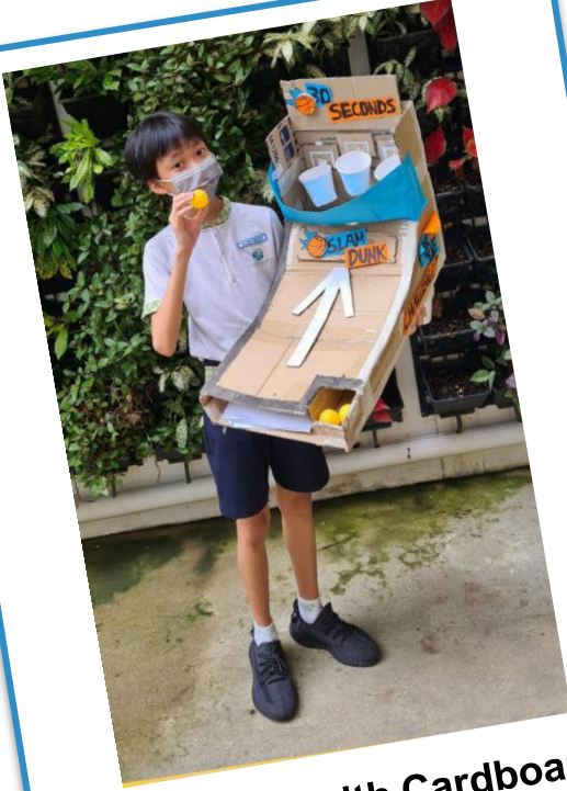
Upcycling with Cardboard