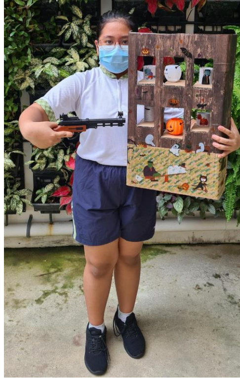
Cardboard Carnival Games