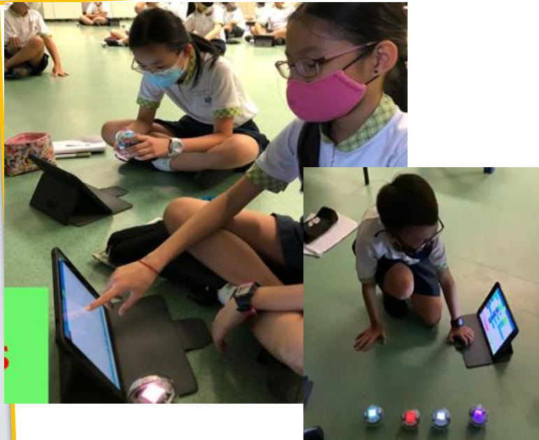
Code For Fun - IMDA