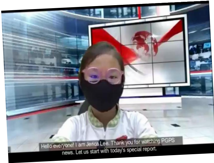
PGPS News Presenters (MTL)