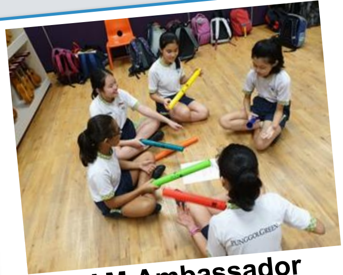
PAM Ambassador Programme