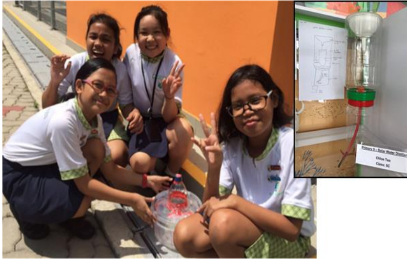
Solar Water Distiller and Electrical Circuits Project