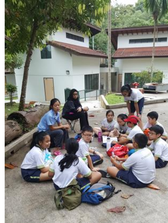
P5 Adventure Camp