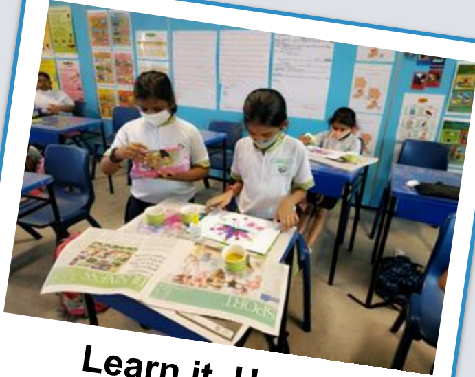
Learn it, Use it, Enjoy it! MTL Fortnight