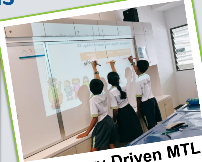
Citizenry-Driven MTL Tasks