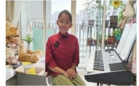
PGPS Got Talent!