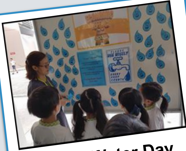
World Water Day