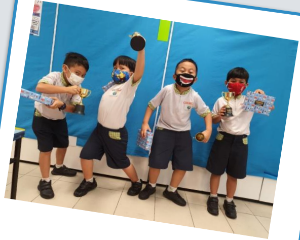
Making My School Values Visible in MTL