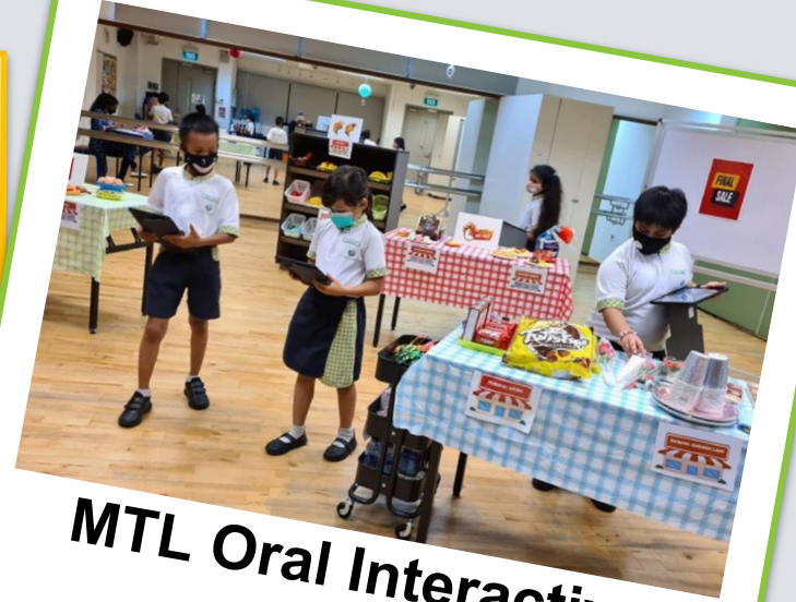
MTL Oral Interactive Tasks