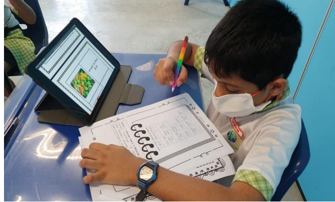
3 Habits of Mother Tongue Language Learners