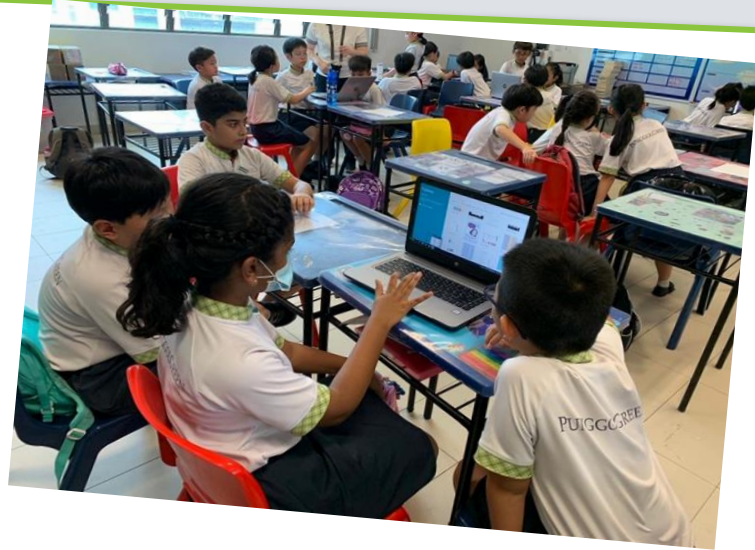
Touch-typing, Powerpoint, Email !