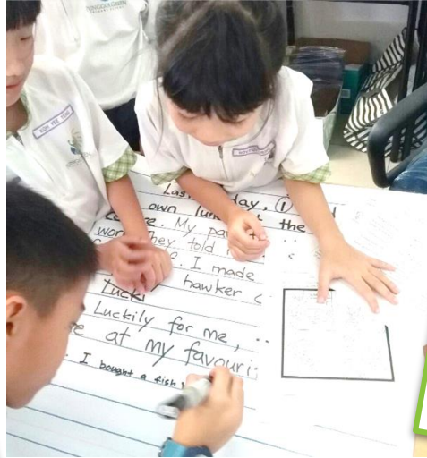
STELLAR Modified Language Experience Approach