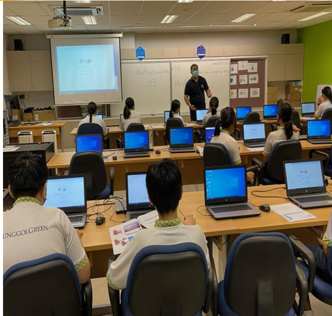
ICT Baseline Skills