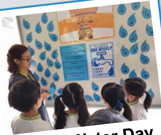
World Water Day