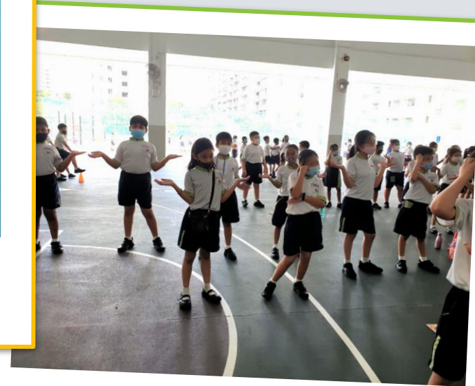
Math-nificent Week & Little Math Genius