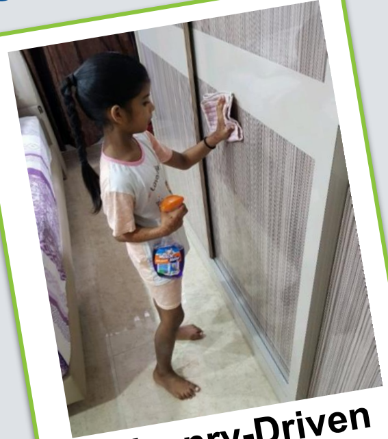
Citizenry-Driven MTL Tasks