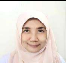
Norheliza Programme Staff