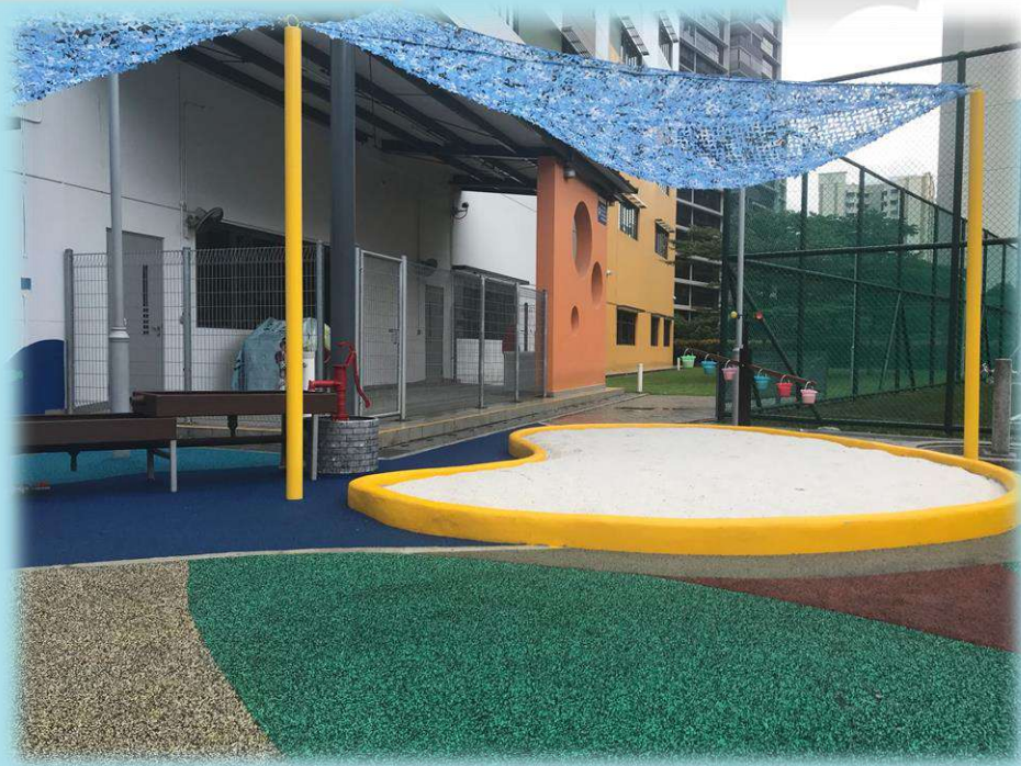
Sand and Water Play