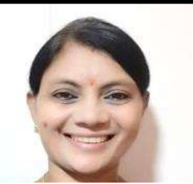
Vanitha Programme Staff