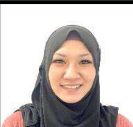
Hirawati Support Staff